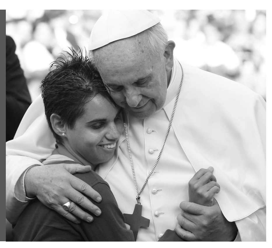
"(The common good...) It means protecting people, showing loving concern for each and every person, especially children, the elderly, those in need, who are often the last we think about." Pope Francis

Showing loving concern for each and every person.